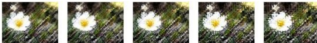
Figure 19: Effect of changes to scaling

The following figure demonstrates the effect applied to a picture with scaling values of zero, 25, 50, 75, and 100, respectively.