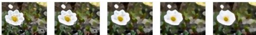
Figure 27: Effect of changes to brushSize

The following figure demonstrates the effect applied to a picture with brushSize values of zero, 2, 5, 7, and 10, respectively.