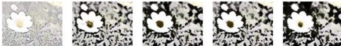
Figure 22: Effect of changes to detail

The following figure demonstrates the effect applied to a picture with detail values of zero, 2, 5, 7, and 10, respectively.