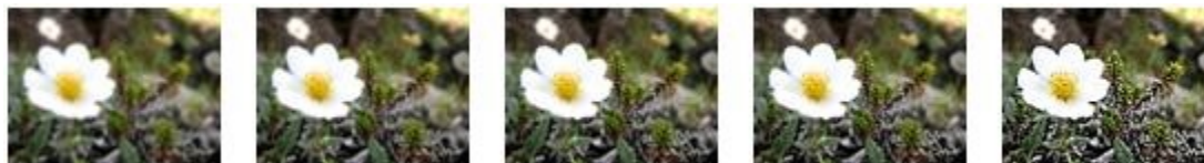
Figure 25: Effect of changes to sharpenSoften

The following figure demonstrates the effect applied to a picture with sharpenSoften values of –100 percent, –50 percent, zero percent, +50 percent, and +100 percent, respectively.