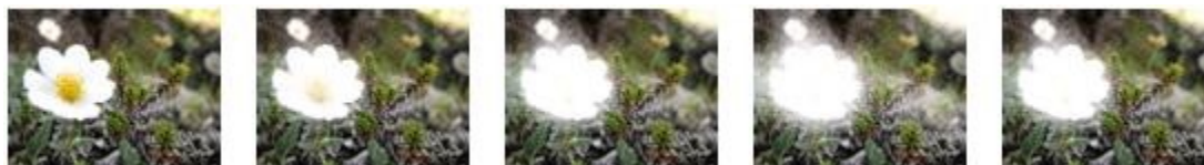
Figure 11: Effect of changes to intensity

The following figure demonstrates the effect applied to a picture with intensity values of zero, 2, 5, 7, and 10, respectively.