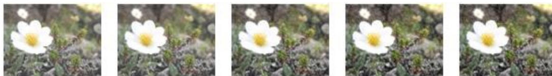
Figure 7: Effect of changes to pressure