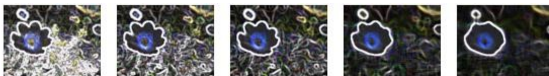
Figure 12: Effect of changes to smoothness

The following figure demonstrates the effect applied to a picture with smoothness values of zero, 2, 5, 7, and 10, respectively.