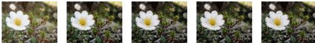
Figure 16: Effect of changes to pressure

The following figure demonstrates the effect applied to a picture with pressure values of zero, 25, 50, 75, and 100, respectively.