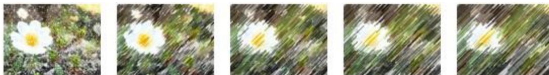
Figure 14: Effect of changes to pencilSize

The following figure demonstrates the effect applied to a picture with pencilSize values of zero, 25, 50, 75, and 100, respectively.