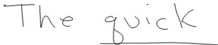
Figure 30: Example ink text

For example, the following figure shows ink that is analyzed as shown in the following code example.