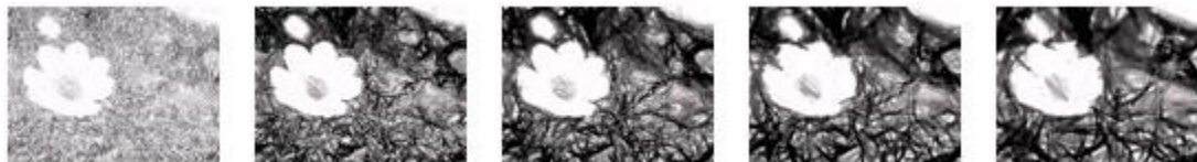
Figure 20: Effect of changes to pencilSize

The following figure demonstrates the effect applied to a picture with pencilSize values of zero, 25, 50, 75, and 100, respectively.