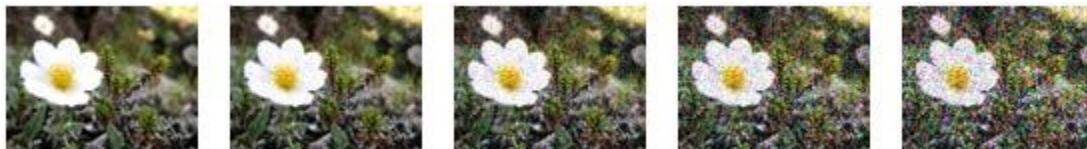
Figure 9: Effect of changes to grainSize

The following figure demonstrates the effect applied to a picture with grainSize values of zero, 25, 50, 75, and 100, respectively.