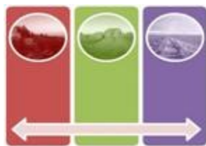
Figure 29: recolorImg is set to "true"

The following W3C XML Schema ( [XMLSCHEMA1] section 2.1) fragment specifies the contents of this element.