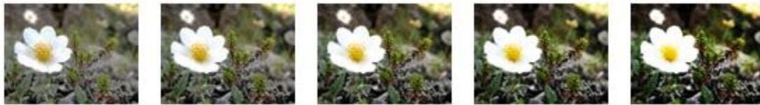
Figure 3: Effect of changes to contrast

The following figure demonstrates the effect applied to a picture with contrast values of –40 percent, –20 percent, zero percent, +20 percent, and +40 percent, respectively.