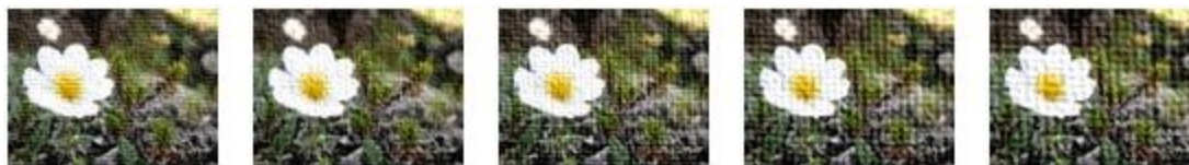
Figure 26: Effect of changes to scaling