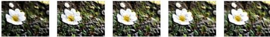
Figure 4: Effect of changes to crackSpacing

The following figure demonstrates the effect applied to a picture with crackSpacing values of zero, 25, 50, 75, and 100, respectively.