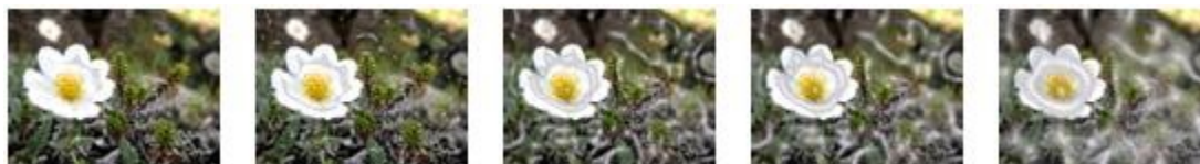
Figure 23: Effect of changes to smoothness

The following figure demonstrates the effect applied to a picture with smoothness values of zero, 2, 5, 7, and 10, respectively.