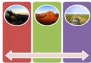
Figure 28: recolorImg is set to "false" or not present

The following figures demonstrate the effect of this flag on a diagram with images in it.