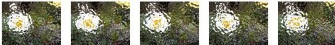
Figure 10: Effect of changes to scaling

The following figure demonstrates the effect applied to a picture with scaling values of zero, 25, 50, 75, and 100, respectively.